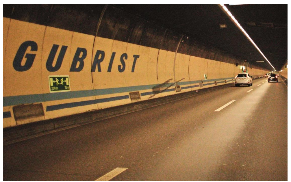
The Gubrist Tunnel is one of the busiest road tunnels in Switzerland and the two existing tubes have been in operation since 1985.